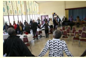
"We'll live for thee, KC!"