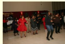
Alumni Mixer - Student Center