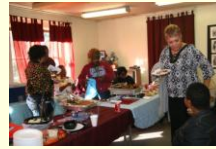
Alumni Reception in Wallace Hall (Sponsored by Knoxville Alumni Chapter)

By responding affirmatively to the campaign call, KC Alumni, will signal to all, their commitment to keep the light on the hill burning brightly, so generations of students can benefit from the invaluable educational opportunities provided by KC.