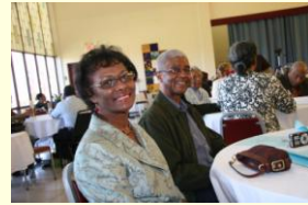
The President's Brunch