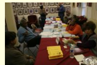
Alumni Registration-Wallace Hall