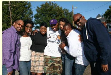
On the "Yard"