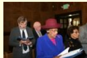
Homecoming Church Services Fourth United Presbyterian Church